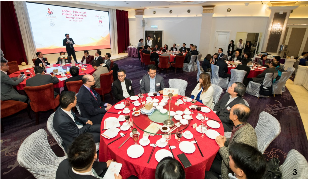
3. eHealth Forum focused on “Trends in Smart Health” was prior to the Annual Dinner.