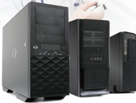
VR專業繪圖創造工作站配置 Radeon Pro WX 專業顯示卡